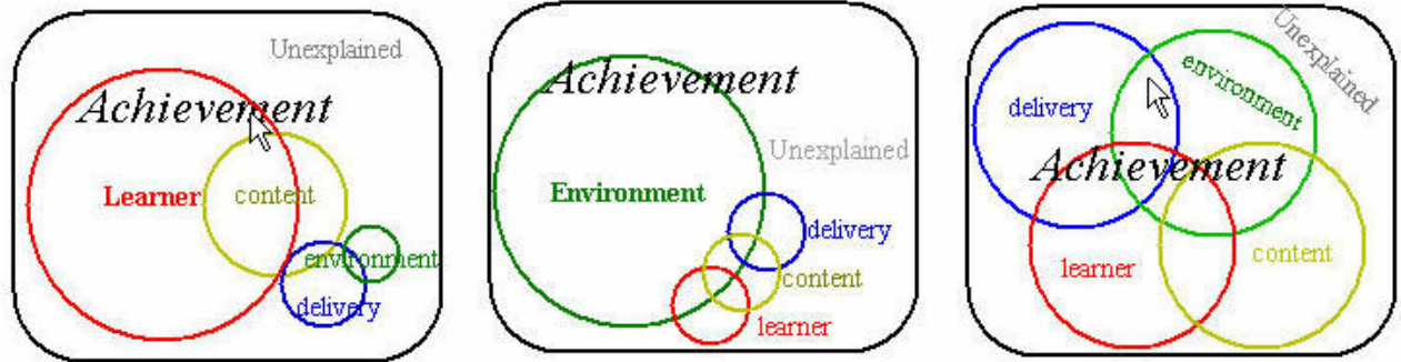
Figure 1. Graphical comparison of educational materials development by emphasis

learner factor. Student achievement is the weighted sum of the delivery, environment, content and learner factors (DECL). For an explanation of the variables under each factor in DECL see Mann (2005a). The importance of each factor in DECL can be weighted under certain conditions. The size of the circles in figure 1 indicates their emphasis and subsequent impact on student achievement.